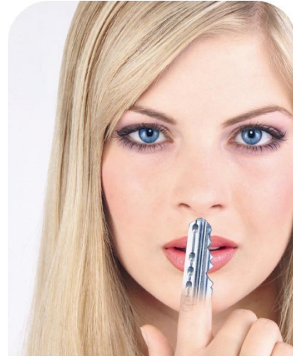
YOUR FINGER IS THE KEY

FINGERPRINT ACCESS CONTROL WEATHER RESISTANT NETWORKABLE